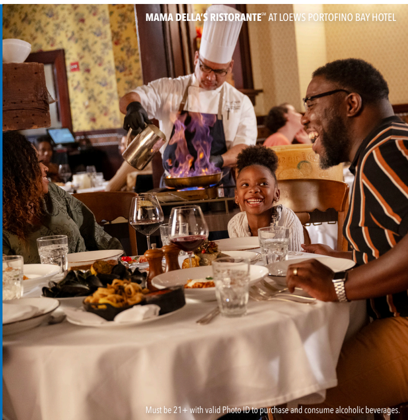
MAMA DELLA'S RISTORANTE™ AT LOEWS PORTOFINO BAY HOTEL

Must be 21+ with valid Photo ID to purchase and consume alcoholic beverages.