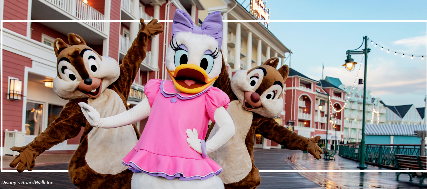
Disney's BoardWalk Inn