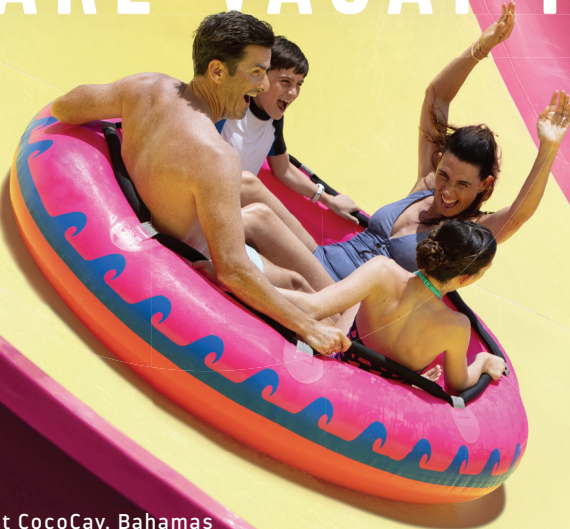
Perfect Day at CocoCay, Bahamas