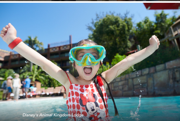
Disney's Animal Kingdom Lodge