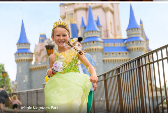
Magic Kingdom® Park