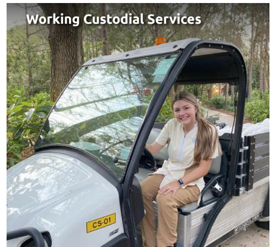
Working Custodial Services

One of my favorite vacation memories was taking my fiancé to Walt Disney World for his first visit ever. He is a huge Star Wars fan, so we started the day in Hollywood Studios at Rise of the Resistance. We used Genie+ to our advantage, and we park hopped to Epcot and Magic Kingdom. We did all of the "big" attractions, and thankfully, he loved it! I can't wait until we get to go again for a longer trip. My goal was to make his first visit to Walt Disney World memorable and joyful so that he'd fall in love and want to go back - mission accomplished!