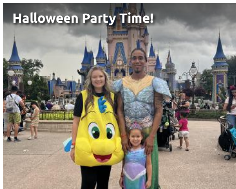
Halloween Party Time!