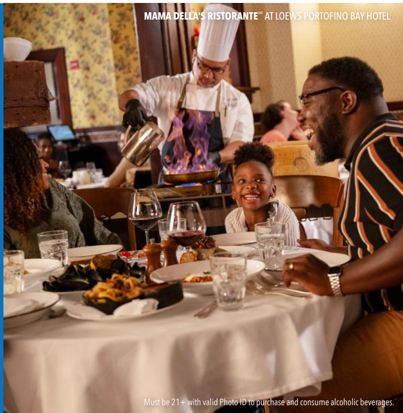
MAMA DELLA'S RISTORANTE™ AT LOEWS PORTOFINO BAY HOTEL

Must be 21+ with valid Photo ID to purchase and consume alcoholic beverages.