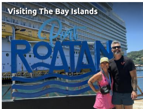
Visiting The Bay Islands