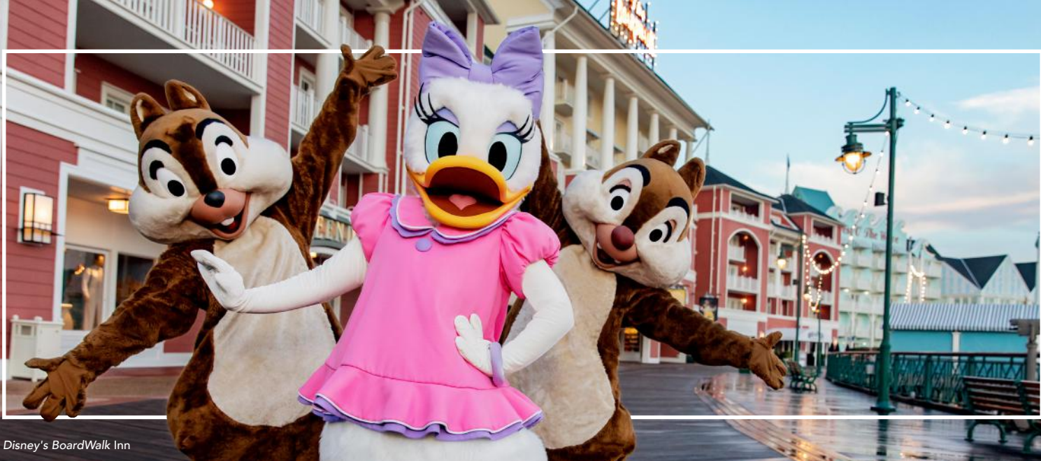
Disney's BoardWalk Inn