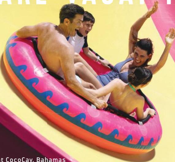
Perfect Day at CocoCay, Bahamas