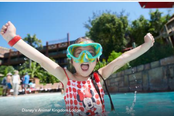
Disney's Animal Kingdom Lodge