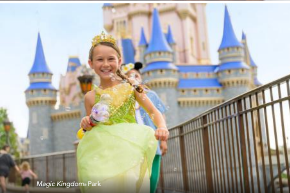
Magic Kingdom® Park